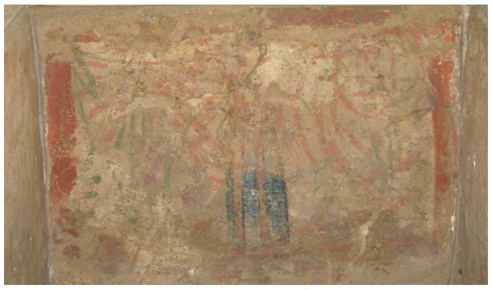
Fig. 4. Female figure/ servant? from the grave from Čalma. / Figura feminină/ servitoare? din inventarul mormântului de la Čalma.