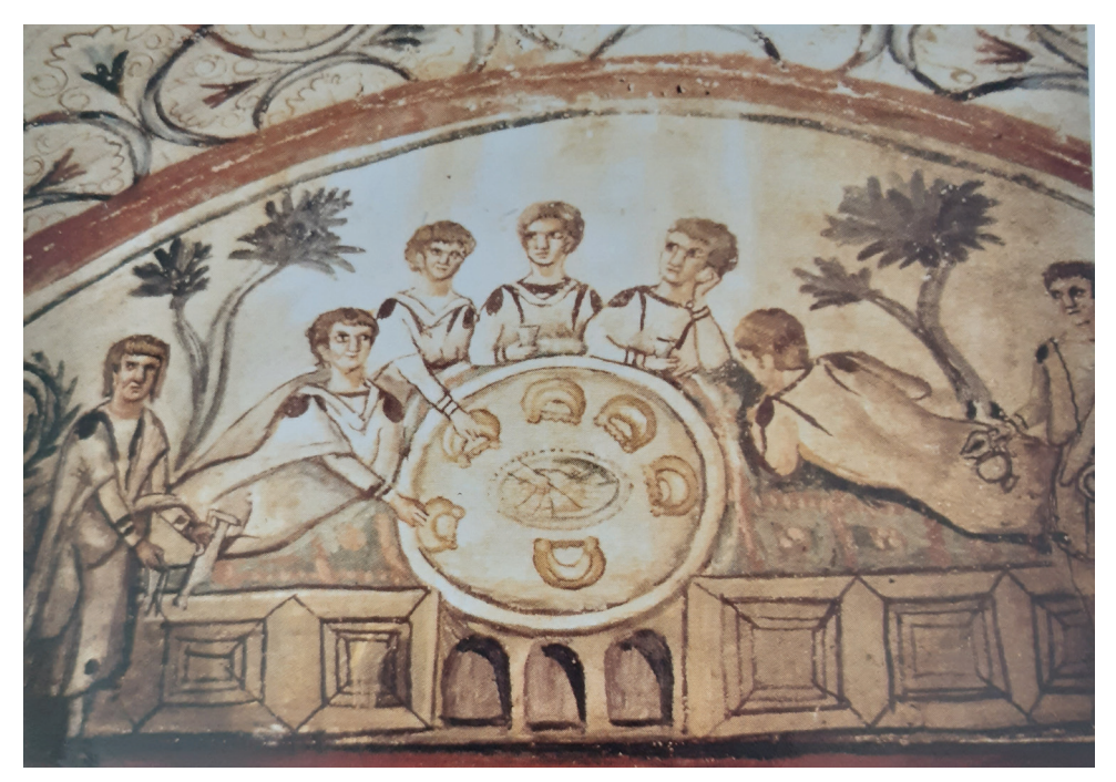
Fig. 6. Funerary banquet from the tomb from Tomis (After: Barbet 1994, Planche A). /Banchet funerar din inventarul cavoului de la Tomis (după: Barbet 1994, Planche A).