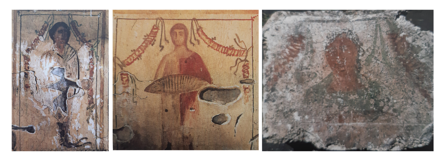
Fig. 5. Figures of servants from the tomb from Philippopolis (Pillinger, Popova, Zimmerman 1999, Tafel 59. Abb. 79, 80 i 81). / Figuri de servitori din inventarul cavoului de la Philippopolis (Pillinger, Popova, Zimmerman 1999, Tafel 59. Abb. 79, 80 și 81).