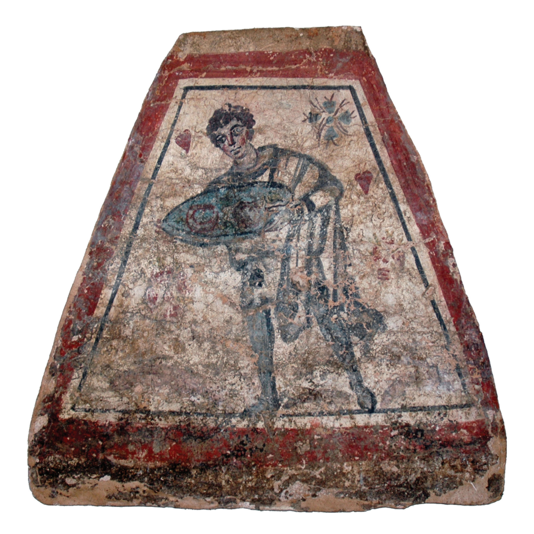
Fig. 2. Figure of a servant from grave G-2624 from Viminacium. / Figura unui servitor din inventarul mormântului G-2624 de la Viminacium.