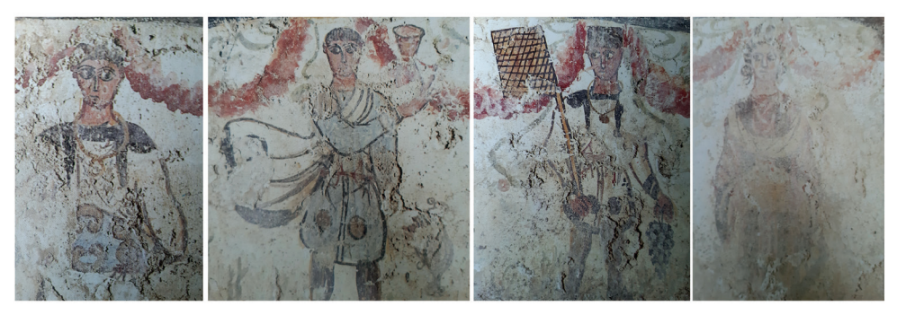
Fig. 3. Figures of servants from Beška tomb (After: Marijanski – Manojlović 1987, fig. 6, 7, 8 and 9). / Figuri de servitori din inventarul cavoului de la Beška (după: Marijanski – Manojlović 1987, fig. 6, 7, 8 și 9).