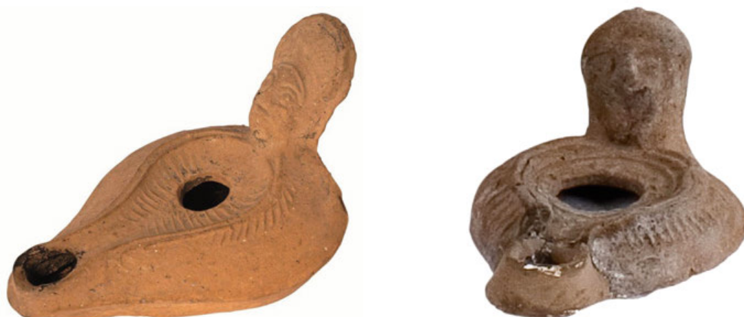
Fig. 4. Oil lamp from Mokranjske Stene

Сл. 3. Каљанац са људским лицем из Равне (према: Петровић, Јовановић 1997, 77, кат. бр. 20)