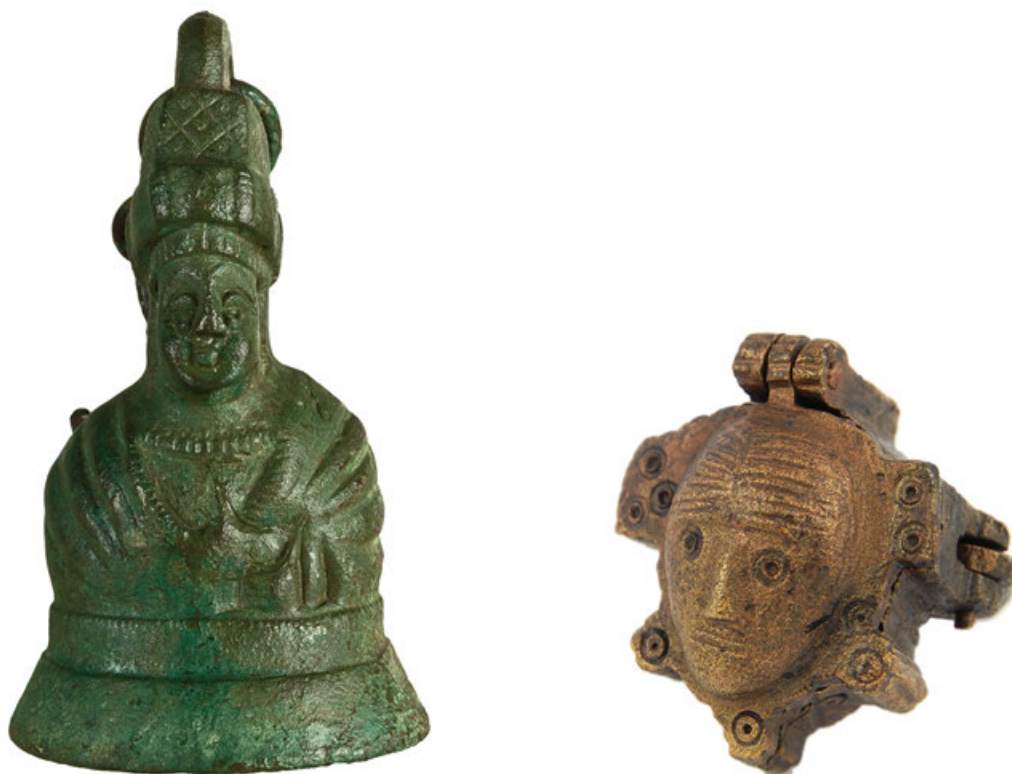
Fig. 2. Steelyard weight with a picture of an Byzantine empress, from the Belgrade National Museum