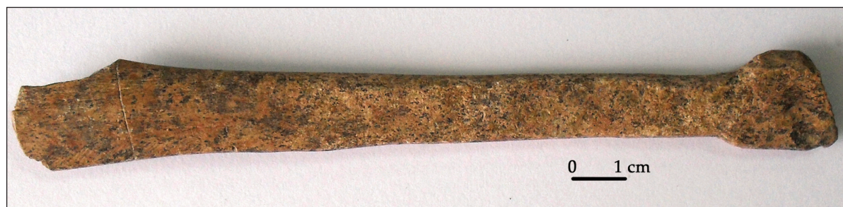
Fig. 7. Spoon made from red deer antler segment.

Ribs are the next most common skeletal elements. Both ribs and metapodials were split longitudinally (Fig. 6). However, since the results were slender, sharp pointed tools, it may be assumed that the purpose of splitting was to create a thinner object, and not to save on material. Several pieces with 'mistakes' (long bone shafts with traces of groove, split somewhat irregularly and discarded) also confirm that there was no need to save raw materials, as they could have been easily repaired by abrasion. Also, the spongy tissue on the lower surface of rib