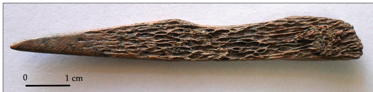
Fig. 6. Awl made from split rib.

from site to site, they rarely exceed 50%. Teeth are rarely used, with boar tusks being used only for tools, while other teeth were perforated and used as decorative items. Mollusc shells also occur, again, in different ratios from site to site, and several species have been recorded: Spondylus , Glycimeris , Cardium and Dentalium (all four have been confirmed only at Vinča-Belo Brdo, see Srejšović, Jovanović 1959 ). Metapodials prevail, the most common being from medium-sized ungulates (sheep, goat, rarely identified roe deer), followed by ribs. Also, different segments of unidentified long bones were used, and the occurrence of astragals should be noted. Some skeletal elements are rare, such as mandibles, or almost never used, such as cranial bones. Large ungulate bones are less common, and pig bones are almost non-existent.