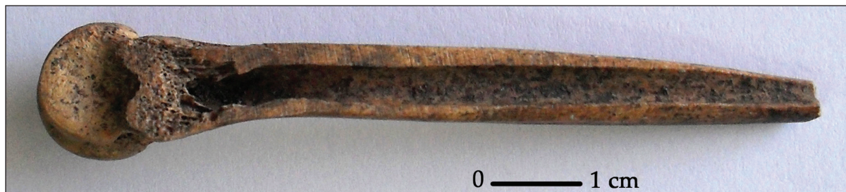
Fig. 5. Awl from longitudinally split ovicaprine metapodial, with half of distal epiphysis preserved at the basal part as a handle.