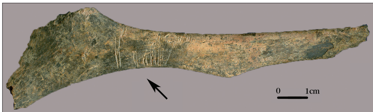
Fig. 3. Right ulna of dog ( Canis familiaris ) with butchering marks.

consumption. Sheep and goat were slaughtered between 18 and 30 months of age, when they reach optimum weight gain (Bulatović 2011.241). Hunting also focused mainly on providing meat, as adult individuals were killed in general. The presence of non-meat bearing bones shows that animals were hunted in the vicinity and often brought to the site whole, where they were butchered. One red deer hyoid with cut marks (Fig. 3) indicates that primary butchering was practiced at the site at least occasionally. Except for meat, animals may also have been hunted for other raw materials, such as skin; a small number of fur-bearing animals should also be mentioned.