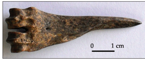
Fig. 4. Awl from ovicaprine metapodial, with entire distal epiphysis preserved at the basal part as a handle.

For a long time, bone artefacts were completely ignored, or only the most interesting items were in-