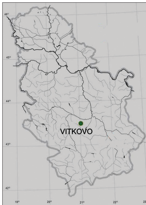
Map. The position of the Neolithic site of Vitkovo.

on the property of the Trifunović family. Two trenches, the first 5 x 5m, and the other somewhat larger, were excavated. One pit, probably a rubbish pit (Fig. 1), was discovered, approx. 4.80 x 3.70m, and daub fragments were recovered in its vicinity, suggesting that a dwelling had been situated nearby. The content of the pit was comprised of ash and numerous portable items: stone and flint tools, pottery, terracotta figurines and altars, which dated the site to the later phases of the Vinča culture, to Vinča-Pločnik I (Čađenović et al. 2003; Čađenović 2007).