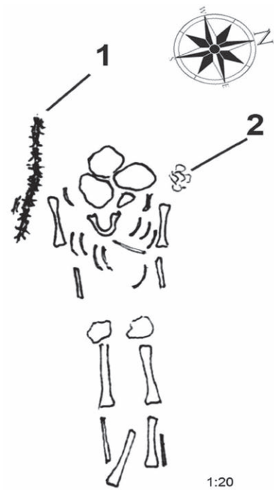
Fig. 2. Grave # 53, Late Roman necropolis at Slog, Timacum Minus (after Petković et al. 2016, 91, Plate III)

to whom it is offered (Nilsson 1907, 530-546), so its eschatological dimension is very clearly underlined 12 . As for placing the egg-shells in the context of pagan religions, it is well known that the egg was one of the attributes of the Dionysian mysteries and, having in mind the Orphic concept by which the world is an egg where the god comes from (therefore, as grave good, the egg represents a symbol of new life, rebirth and immortality), further elaboration is not necessary. But apart from egg-shells in the boy's grave, by his right side the skeleton of a snake was also found, placed in a parallel position with the body of the deceased. It is generally known that the snake accompanies different deities, but it is most frequently the faithful companion of Dionysus, his Asia Minor-Thracian counterpart Sabazius, healer-god Asclepius and goddess Hygieia. The cult of Dionysus has not been epigraphically confirmed in Timacum Minus, although a corpus of monuments related to the god implies that his cult was not only known, but indeed very popular in this part of the Roman Empire (Petković et al. 2016, 39-50). In the theology and iconography of Dionysus, as a hypostasis of the god, the snake has a chthonic, eschatological and apotropaic dimension, and is usually shown beside or behind the deity, or at the bottom of the scene and inside or next to a cista mistica . Regarded as a chthonic and fertility symbol, the snake represented the respective functions of Dionysus.