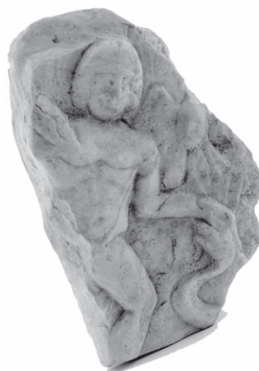
Fig. 4. Marble relief of Zeus Zbelsurdos, from Timacum Minus (after Petković et al. 2016, 93, Plate V, fig. 5)

The relicts of Dionysian beliefs, regardless of the subsequent Christian superstructure, are very strong in the folklore tradition of today's eastern Serbia, among Vlach population, as we already mentioned – they celebrate the agrarian feast associated with a belief in the cyclical renewal of nature and life, reincarnation and immortality of the soul, which is again in connection with the autochthonous tradition of worship and ritual practices in the Dionysus cult. The contemporary celebration includes the ecstatic trance of the consecrated women called rusalja – which is derived from the Vulgar Latin name for a Roman holiday of Dionysian type, the Rosalia – and who are believed to communicate with the dead. A similar custom can be recognized in the Bulgarian ritual Lazaruvane, especially in its eastern Bulgarian version Buenek , a traditional festival possibly connected to the Brumalia , dedicated to Dionysos Bromios in Antiquity (Gitcheva 2002, 927-940), when, with songs and dance, the belief in life after death was celebrated.