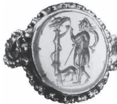
Fig. 5. Syncretistic representation of Sabazius on golden ring from Vinik, Naissus (after Јовановић 1977, 87-90, сл. 1)