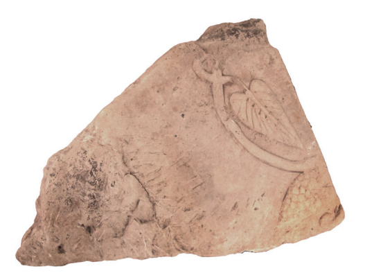
Fig. 18 – Monument with grapes (inv. nr. 619, Horreum Margi Museum) / Monument cu struguri (inv. N° 619, Horreum Margi Museum)