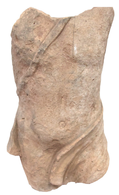
Fig. 23 – Man's torso (inv. nr. 606, Horreum Margi Museum) / Tors de bărbat (inv. Nº 606, Horreum Margi Museum)