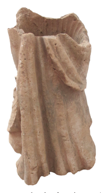
Fig. 25 – Back side of man's torso (inv. nr. 606, Horreum Margi Museum) / Torsul de bărbat văzut din spate (inv. N° 606, Horreum Margi Museum)