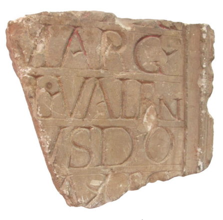
Fig. 15 – Monument with inscription (inv. nr. 635, Horreum Margi Museum)/ Monument cu inscripție (inv. N° 635, Horreum Margi Museum)