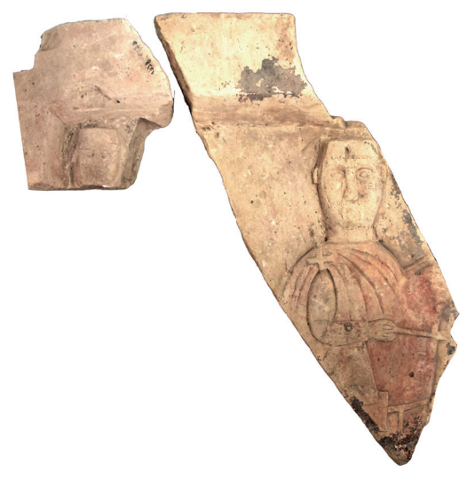
Fig. 19 – Tombstone with human figures (inv. nr. 613, Horreum Margi Museum) / Piatră de mormânt cu figuri umane (inv. Nº 613, Horreum Margi Museum)