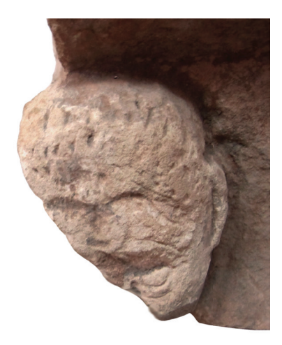
Fig. 9 – Detail of the monument with a possible image of tetrarchs (inv. nr. 611, Horreum Margi Museum) / Monumentul cu efigia probabilă a tetrarhilor (Inv. N° 611, Horreum Margi Museum) – detaliu

Fig. 8 – Detail of the monument with a possible image of tetrarchs (inv. nr. 611, Horreum Margi Museum) / Monumentul cu efigia probabilă a tetrarhilor (Inv. N° 611, Horreum Margi Museum) – detaliu