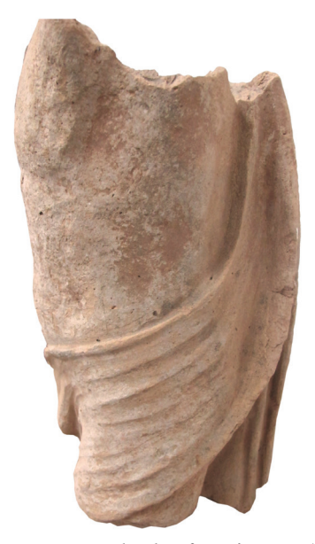
Fig. 24 – Lateral side of man's torso (inv. nr. 606, Horreum Margi Museum) / Torsul de bărbat văzut din lateral (inv. Nº 606, Horreum Margi Museum)