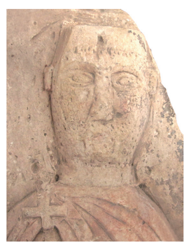
Fig. 22 – Detail of the man's portrait from the tombstone with human figures (inv. nr. 613, Horreum Margi Museum) / Portretul bărbatului de pe piatra de mormânt cu figuri umane (inv. Nº 613, Horreum Margi Museum) – detaliu