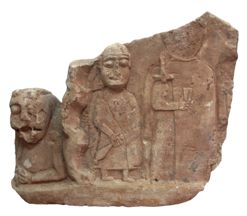
Fig. 2 – Tombstone with a lion and three human figures (inv. nr. 615, Horreum Margi Museum) / Piatra de mormânt cu leu şi trei figuri umane (Inv. Nº 615, Horreum Margi Museum)

Fig. 1 – Marble icon of Mithras (inv. nr. 614, Horreum Margi Museum) / Efigie în marmură reprezentîndu-l pe Mithras (Inv. Nº 614, Horreum Margi Museum)