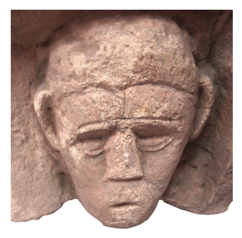
Fig. 8 – Detail of the monument with a possible image of tetrarchs (inv. nr. 611, Horreum Margi Museum) / Monumentul cu efigia probabilă a tetrarhilor (Inv. N° 611, Horreum Margi Museum) – detaliu