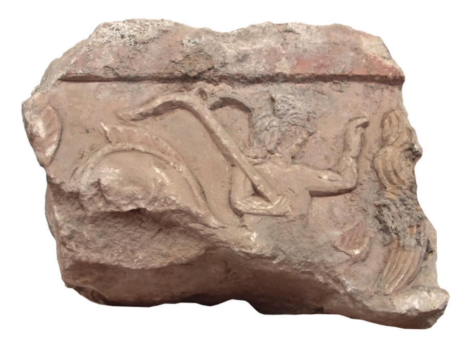
Fig. 13 – Monument with Triton or Satyr (inv. nr. 632, Horreum Margi Museum) / Monument cu triton sau satir (inv. N° 632, Horreum Margi Museum)