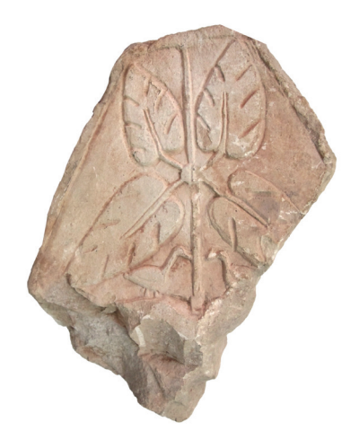
Fig. 17 – Monument with floral scene and birds (inv. nr. 616, Horreum Margi Museum) / Monument cu imagine florală și păsări (inv. № 616, Horreum Margi Museum)