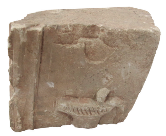
Fig. 16 – Lateral side of the monument with inscription (inv. nr. 635, Horreum Margi Museum) / Faţeta laterală a monumentului cu inscripţie (inv. N° 635, Horreum Margi Museum)