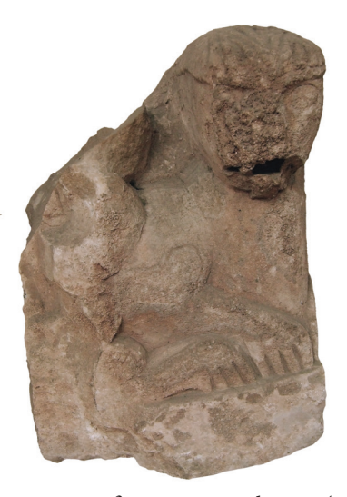
Fig. 6 – Lion figure on a tombstone (inv. nr. A47_11, Regional Museum of Jagodina) / Leu pe o piatră de mormânt (Inv. N° A47_11, Regional Museum of Jagodina)