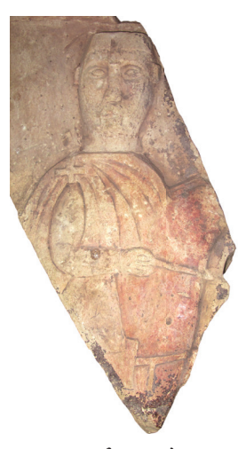
Fig. 21 – Image of a man's portrait from the tombstone with human figures (inv. nr. 613, Horreum Margi Museum) / Portret de bărbat de pe piatra de mormânt cu figuri umane (inv. N° 613, Horreum Margi Museum)