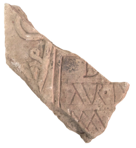
Fig. 14 – Marble tombstone with inscription (inv. nr. 617, Horreum Margi Museum) / Piatră de mormânt din marmură, inscripționată (inv. N° 617, Horreum Margi Museum)

Fig. 13 – Monument with Triton or Satyr (inv. nr. 632, Horreum Margi Museum) / Monument cu triton sau satir (inv. N° 632, Horreum Margi Museum)