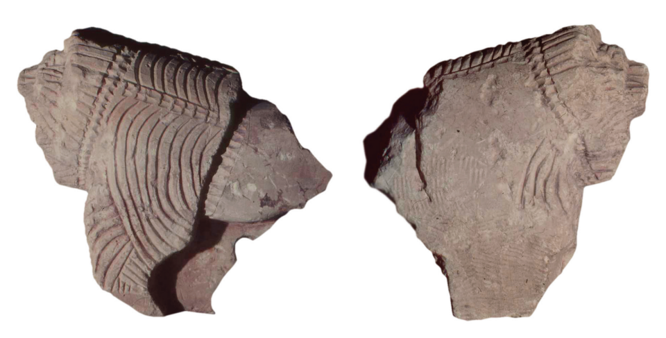
Fig. 11 – Detail of the lion (C no. 79) / Detaliu din imaginea leului (C no. 79)