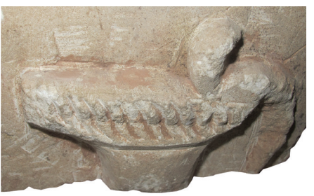
Fig. 16 – Detail of the lateral side of the monument with inscription (inv. nr. 635, Horreum Margi Museum) / Faţeta laterală a monumentului inscripționat (inv. N° 635, Horreum Margi Museum) – detaliu