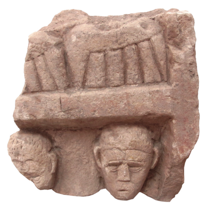
Fig. 7 – Monument with a possible image of tetrarchs (inv. nr. 611, Horreum Margi Museum) / Monument cu o efigie probabilă a tetrarhilor (Inv. Nº 611, Horreum Margi Museum)