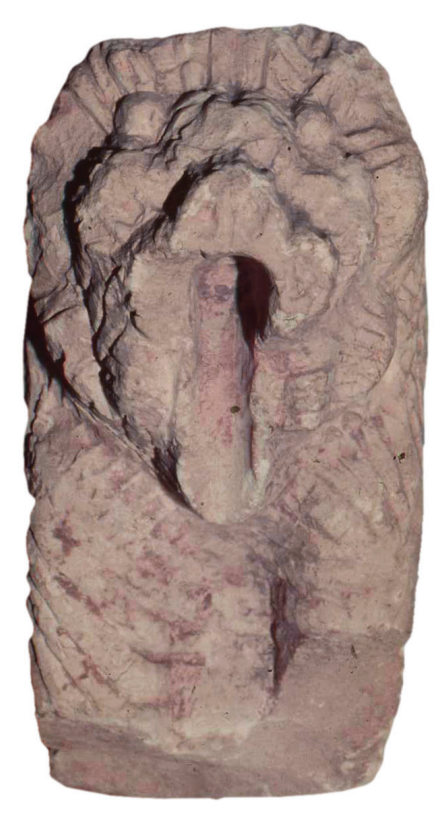
Fig. 10 – Figure of a lion (C no. 79) / Imaginea unui leu (C no. 79)