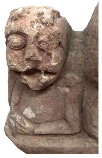
Fig. 3 – Lion figure on the tombstone (inv. nr. 615, Horreum Margi Museum) / Reprezentarea leului pe piatra de mormânt (Inv. Nº 615, Horreum Margi Museum)