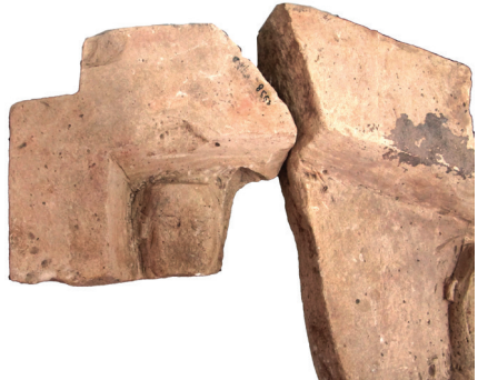
Fig. 20 – Image of a man's head from the tombstone with human figures (inv. nr. 613, Horreum Margi Museum) / Cap de bărbat de pe piatra de mormânt cu figuri umane (inv. Nº 613, Horreum Margi Museum)