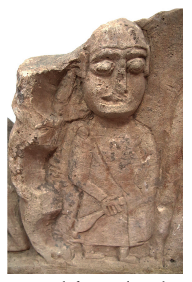
Fig. 4 – Female figure on the tombstone (inv. nr. 615, Horreum Margi Museum) / Reprezentarea figurii feminine pe piatra de mormânt (Inv. Nº 615, Horreum Margi Museum)