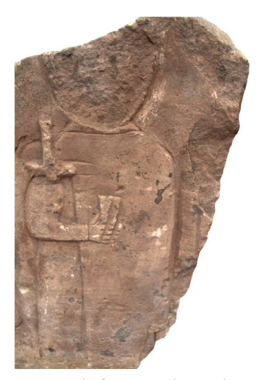
Fig. 5 – Male figure on the tombstone (inv. nr. 615, Horreum Margi Museum) / Reprezentarea figurii masculine pe piatra de mormânt (Inv. Nº 615, Horreum Margi Museum)