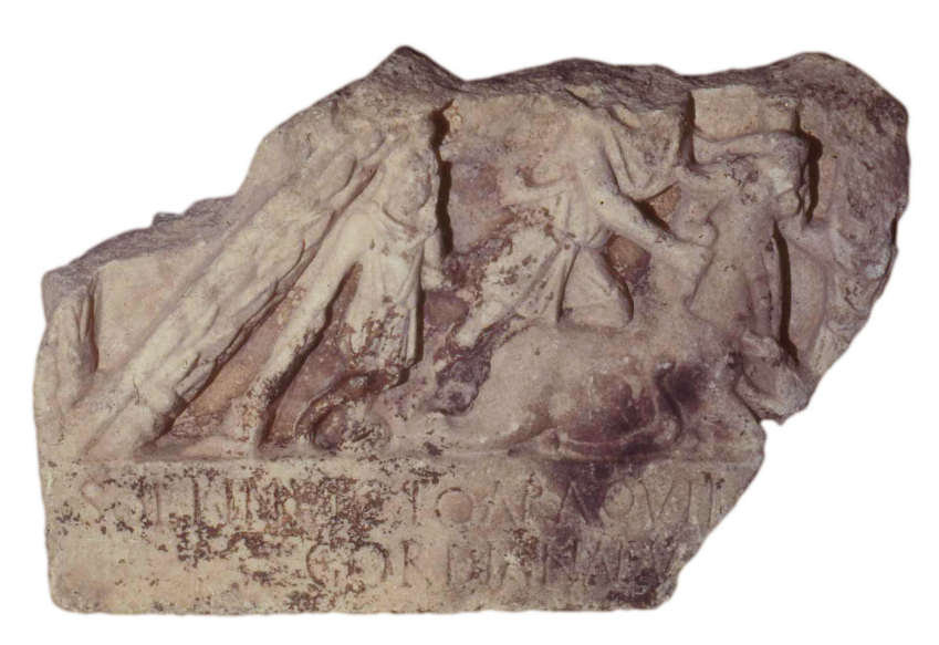
Fig. 1 – Marble icon of Mithras (inv. nr. 614, Horreum Margi Museum) / Efigie în marmură reprezentîndu-l pe Mithras (Inv. Nº 614, Horreum Margi Museum)