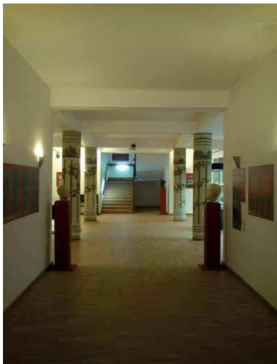
Fig. 2 Archaeological park Viminacium, Domus Scientiarum Viminacium – the exhibition rooms.