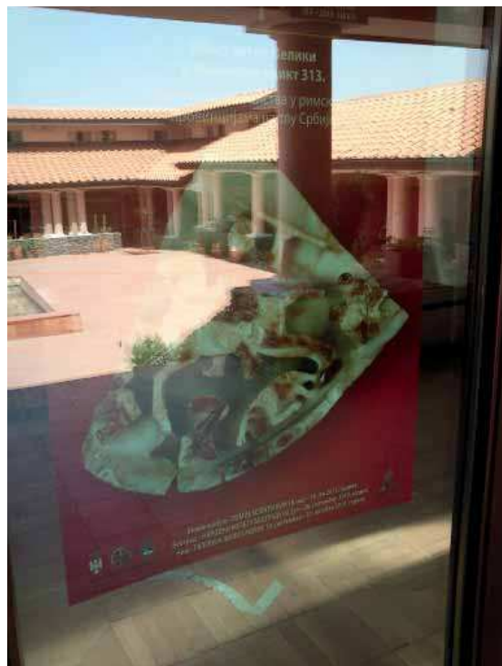
Fig. 3 Cameo from Kusadak (poster of the exhibition).