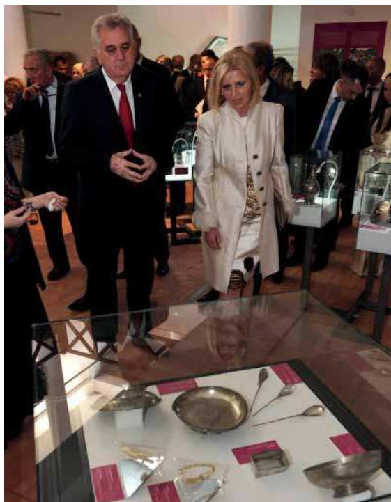
Fig. 6 Silver dishes and spoons with Christian features.