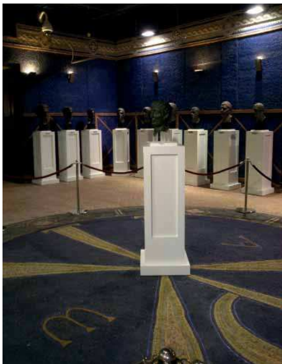
Fig. 4 Pilasters with the busts of Roman emperors; in the centre the famous gilded bronze bust of Constantine the Great.