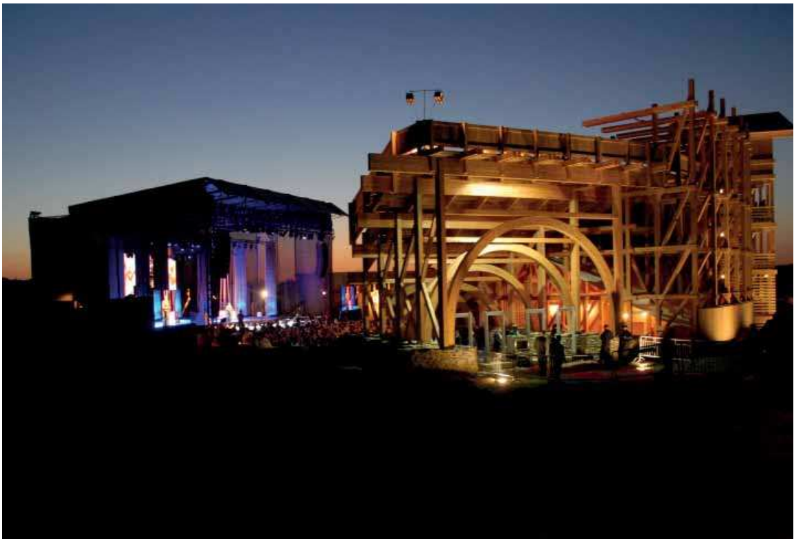
Fig. 12 Reconstructed Roman amphitheatre of Viminacium.