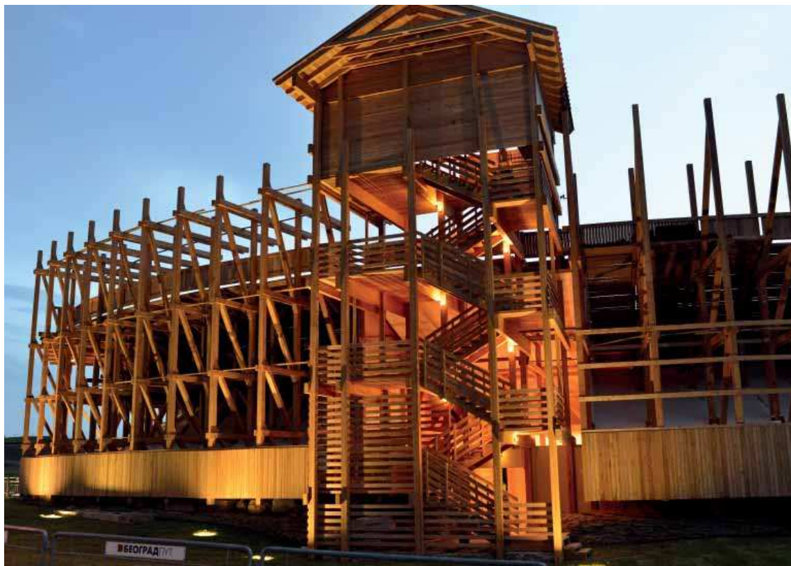
Fig. 13 Reconstructed Roman amphitheatre of Viminacium.

uments among which is also Serbia. The first results show that the Archaeological Park Viminacium has developed into a tourist destination of great importance in recent years, especially since it lies along the cultural-historical road which became part of a tourist project Itinerarium Romanum Serbiae . 5