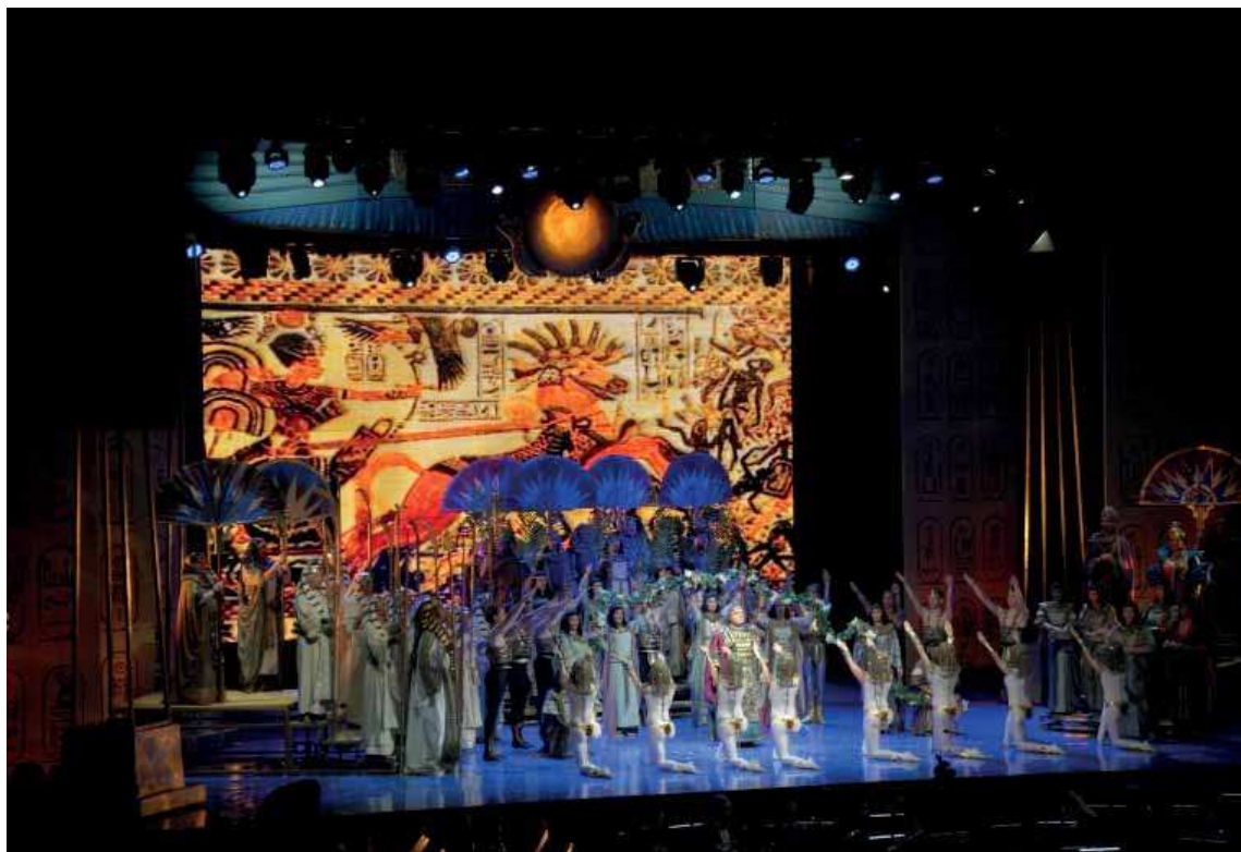
Fig. 10 Verdi's opera Aida in reconstructed Roman amphitheatre of Viminacium.