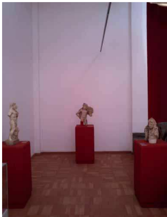
Fig. 5 Sculptures of genius of spring and winter from Singidunum.

mains of sacred objects that point to the Christian commitment of a substantial part of the residents of the ancient city.