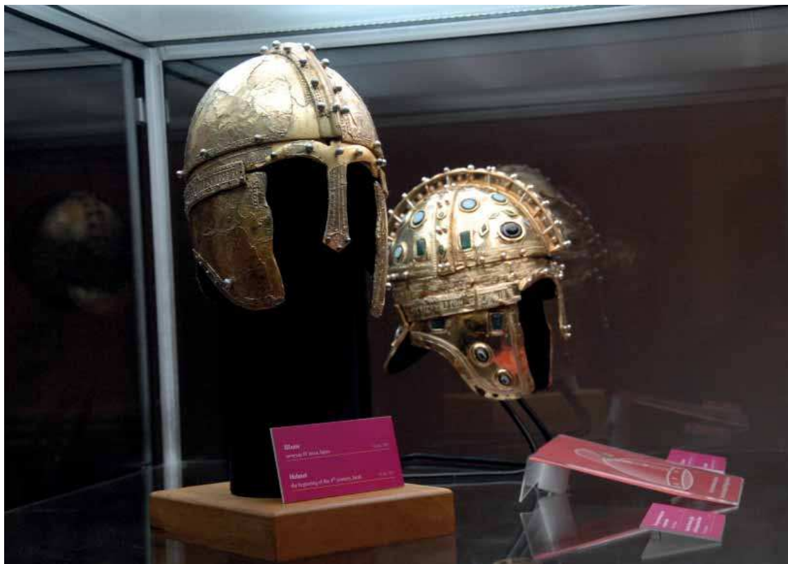
Fig. 9 Luxuriously decorated helmets encrusted with gold foil from Berkasovo.