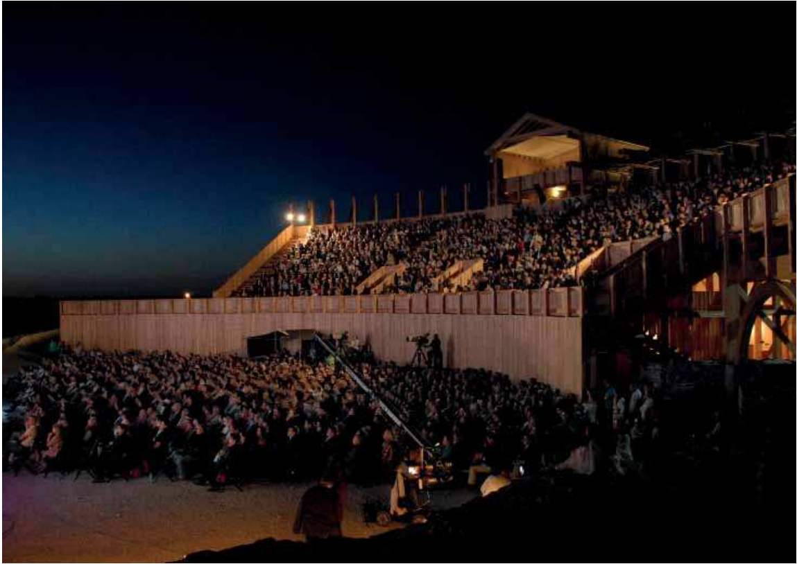
Fig. 11 Reconstructed Roman amphitheatre of Viminacium.