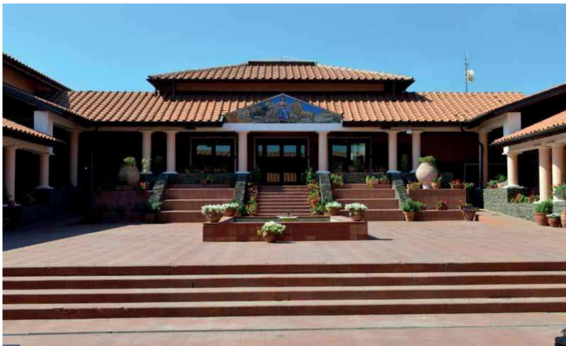
Fig. 1 Archaeological park Viminacium, Domus Scientiarum Viminacium.

The exhibition was divided into several thematic parts which covered several periods: before the Tetrarchy, the Tetrarchy and the period of the rule of Constantine the Great and his successors. The richness of life in the urban centres of the Roman provinces of the territory of the Central Balkans was represented by items of gold, silver and bronze which are archaeological finds from the residential complexes of Sirmium , Mediana , Romulina , Šarkamen etc. More than 180 artefacts were on display, produced between the 2 nd century AD and the time of Constantine's successors in the period of Late Antiquity. They represented archaeological items found in the territory of Serbia which have been preserved in museums. Among the displayed items (sculptures, fragments of architectural decoration, frescoes, mosaics, jewellery, silver dishes, parts of military equipment and Roman imperial coins), there were several artefacts of exceptional value such as a helmet from Berkasovo in Vojvodina, imperial jewellery from Šarkamen in eastern Serbia, a cameo from Kusadak (Fig. 3) etc.