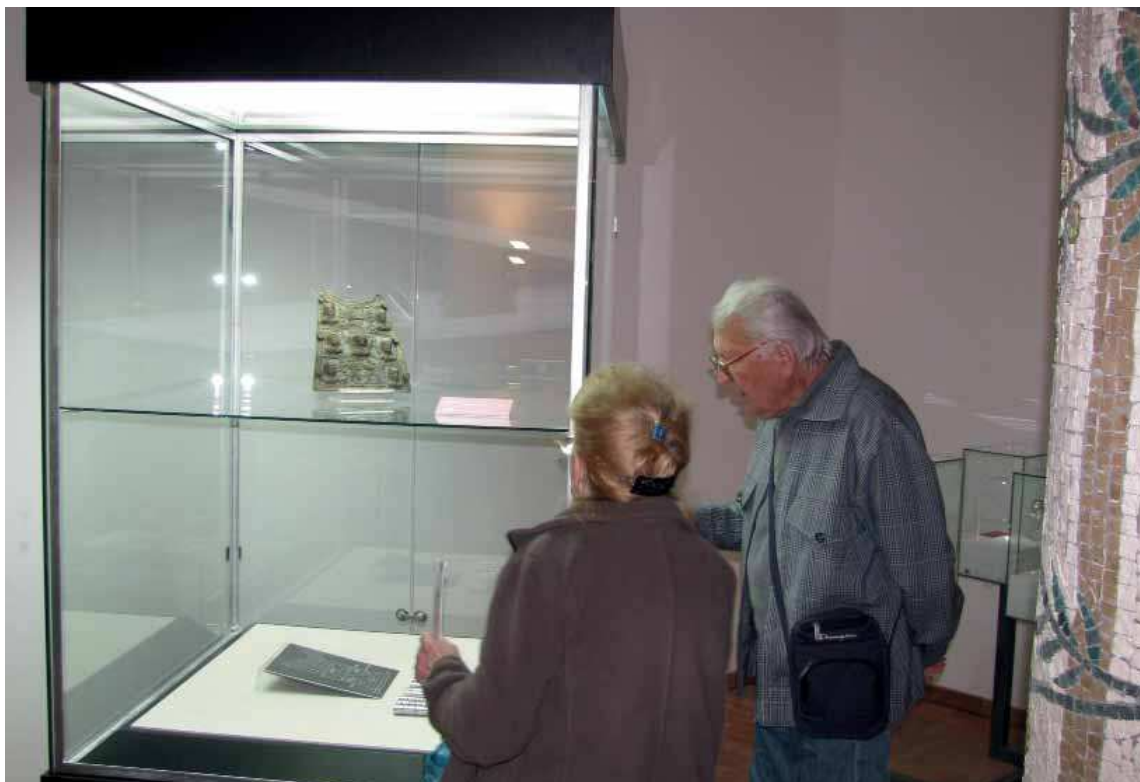
Fig. 8 Pectoral from Ritopek.