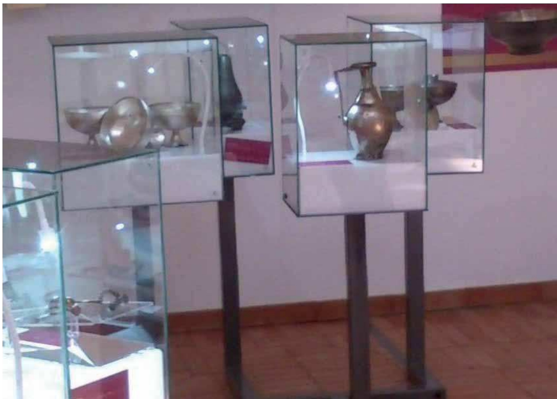
Fig. 7 Silver dishes with Christian features.