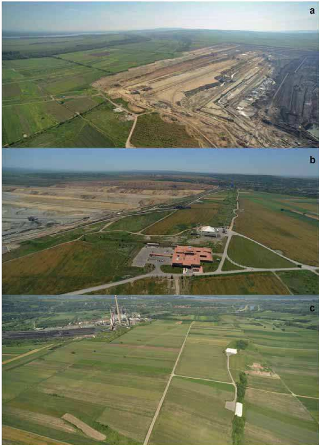
Fig. 14 Natural, civilisational, cultural and historical factors of the landscape. a. Open pit “Drmno“. b. Buildings in the Archaeological park Viminacium and the open pit “Drmno“. c. Archaeological park Viminacium, the power plant “Kostolac B“, the rivers Mlava and Danube and the village of Stari Kostolac (Nikolić, E., Ilić, O. and Rogić, D. 2013: 266, fig. 7.