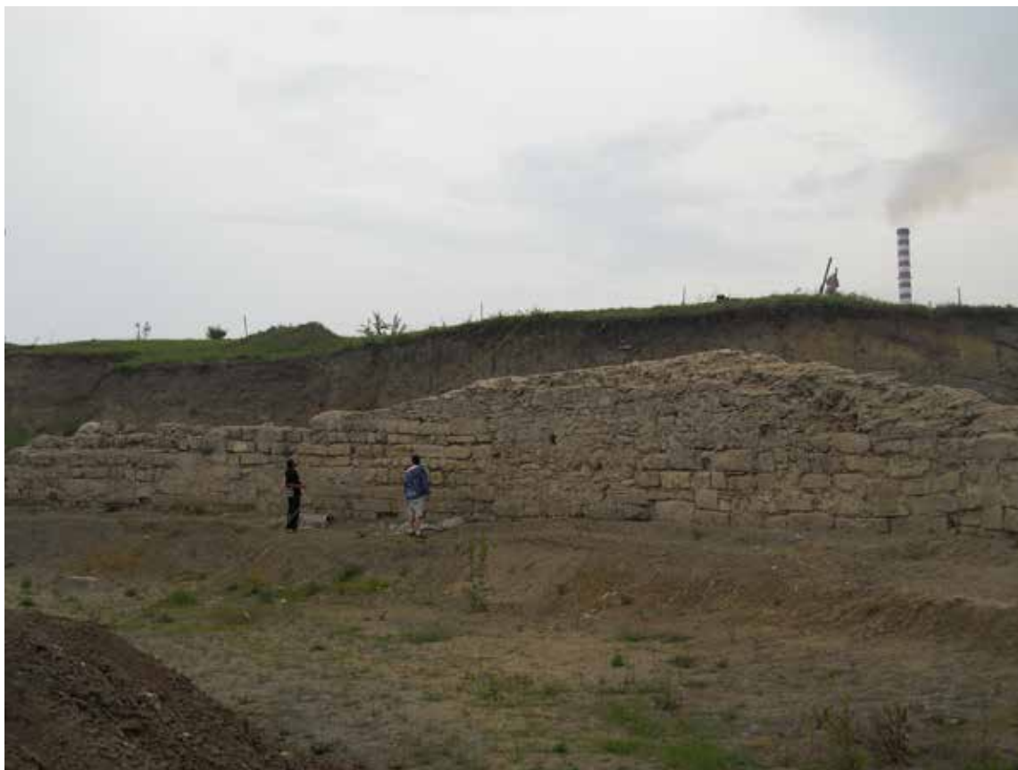
Fig. 1. Arena wall of the amphitheatre (documentation of the Institute of Archaeology Belgrade).

as bedding, pointing, and rendering mortars (with or without wall paintings), all coming from the arena wall of the amphitheatre and a small structure found beneath its auditorium (construction no.2, assumed to be a small shrine – aedicula), but also a sample of the lime mortar from the core of an outer city wall next to the building ( results of the research done by IMS - Delić, Nikolić, I. et al. 2011, are partly published in Nikolić et al. 2016 and Nikolić and Bogdanović 2012). Samples examined in 2014 in IMS and Vinča Institute of Nuclear Sciences, University of Belgrade, were again those of rendering lime mortar from the arena wall, but also those taken from the small built structure found under the auditorium (construction no.1), all with wall paintings (the research was done for the purpose of Rogić 2014; research done by IMS - Vušović, O. and Ivočić, B. 2014, has not been published, while the one done by Vinča Institute - dr M. Gajić-Kvašček and V. Andrić, is part of Rogić 2014). The C.S.G. Palladio Laboratories research of bedding mortars included the analyses of mineralogic and petrographic composition with the determination of materials. The IMS research of bedding, pointing and rendering mortars without paintings included the analyses of the volume mass, water absorption, compression strength, porosity with the pore distribution, chemical composition, and mineralogic and petrographic composition with the