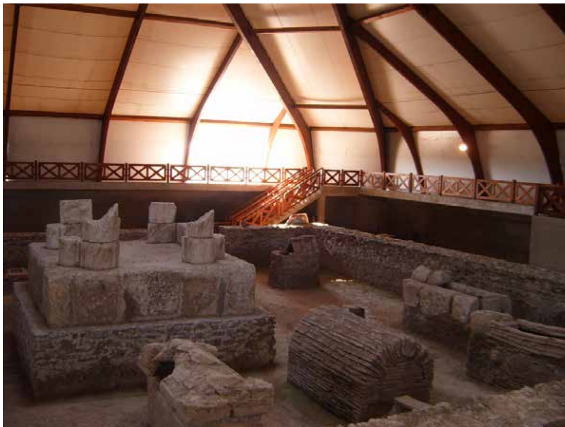
Fig. 2. Mausoleum (documentation of the Institute of Archaeology Belgrade).

mortars can achieve hydraulicity in a few ways: using a quarry sand with a high percentage of clay as an aggregate, natural or artificial hydraulic lime as a binder (using a limestone with impurities – natural, or adding certain materials to the limestone before or after its burning - artificial), or using certain materials of natural or artificial origin with pozzolanic features, as an addition to, or replacement for, the aggregate (Nikolić, Rogić and Milovanović 2015: 71-72).