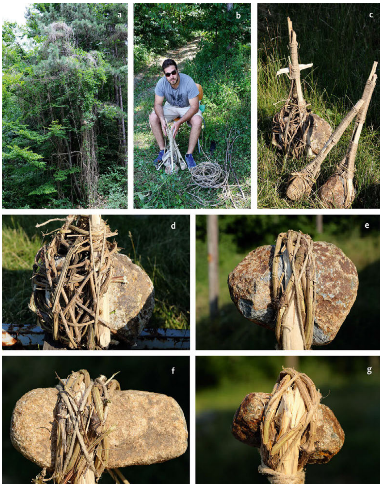
Fig. 5. Hafting of hammerstone heads to a wooden handle