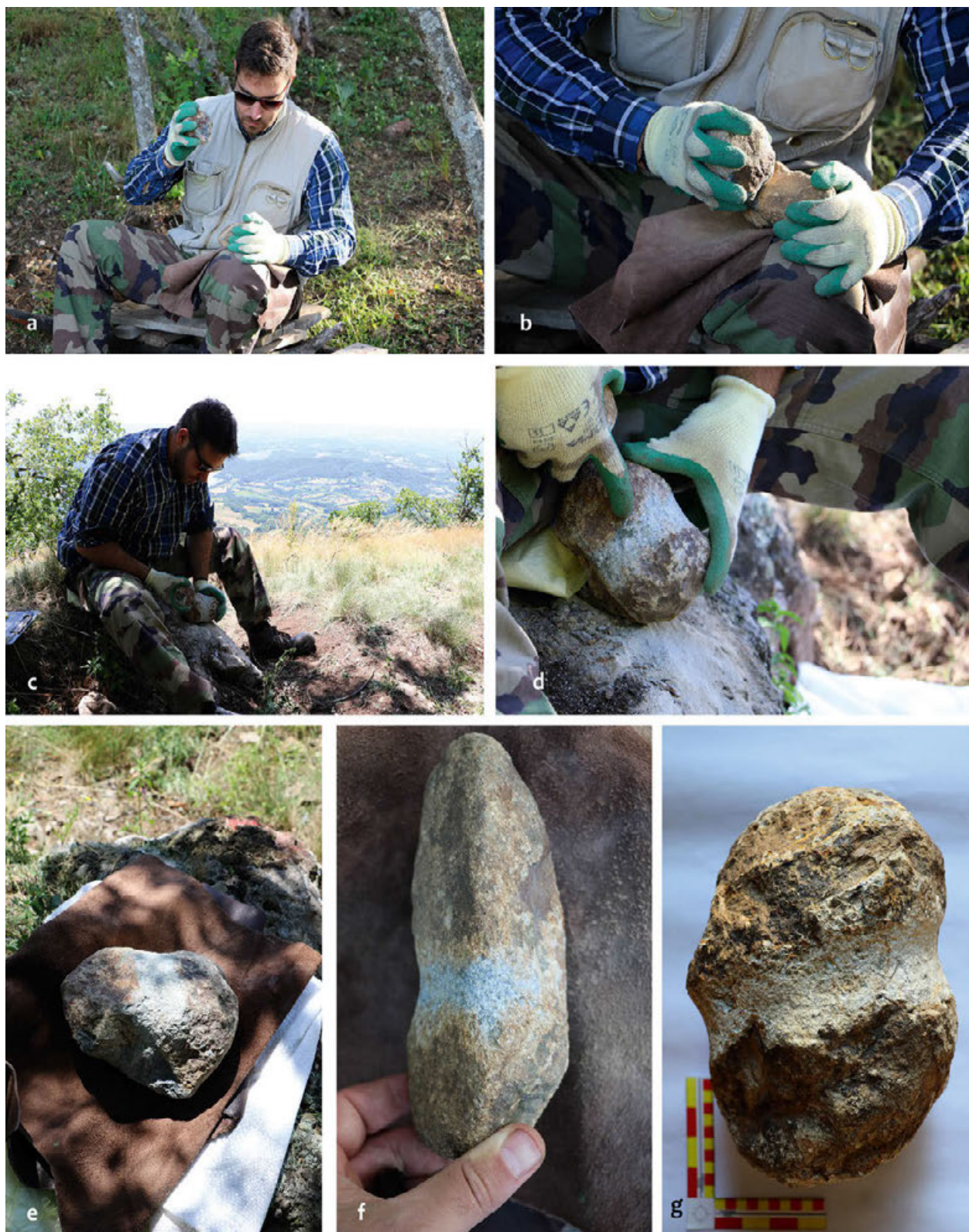
Fig. 4. a, b, c) Raw material processing using the pecking technique and groove making; d–g) appearance of the transversal groove

Сл. 4. a, b, c) обрада сировине техником озрђавања и израда жлеба; d–g) изглед појечне жлеба