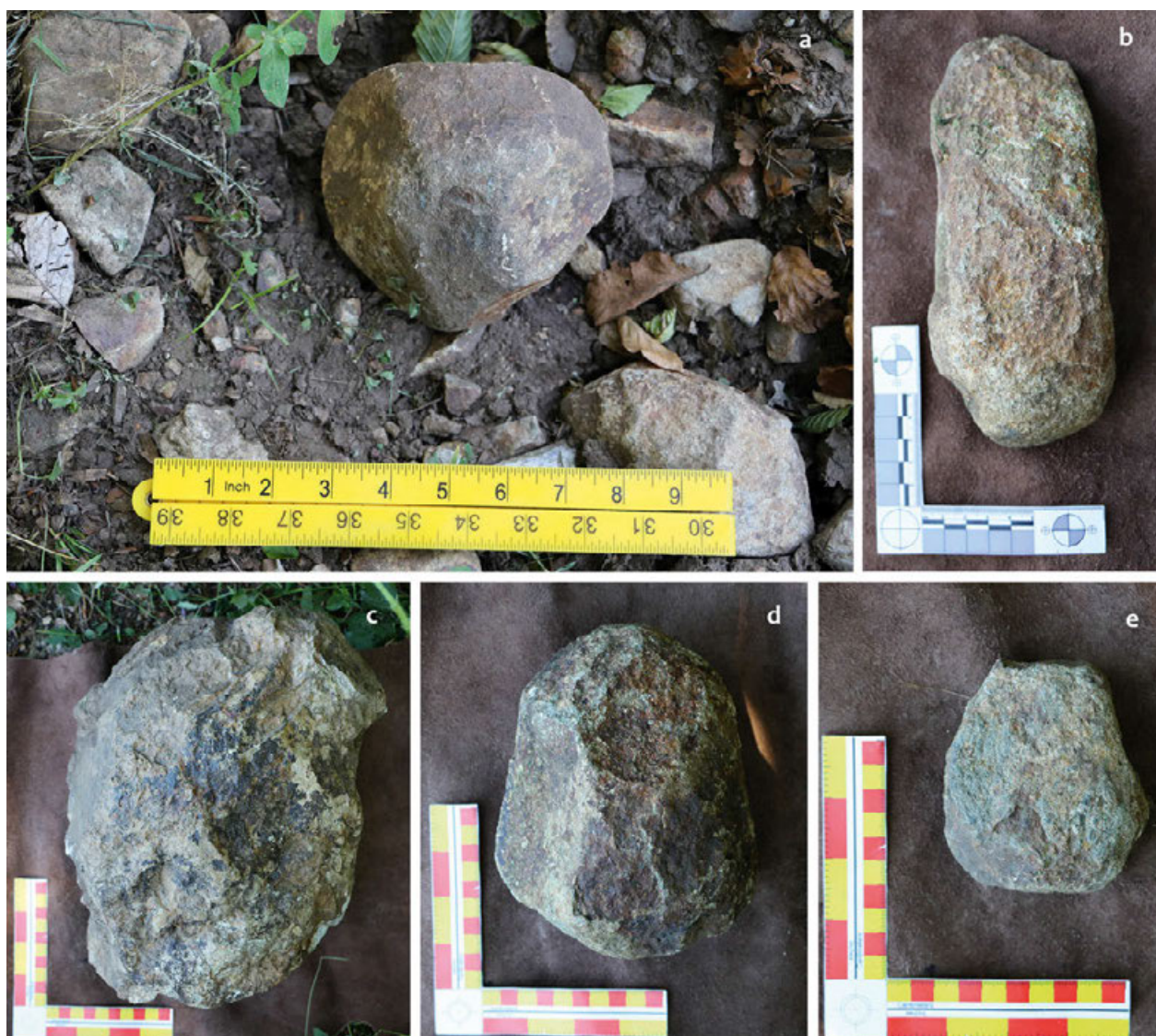
Fig. 3. Raw materials are collected for the production of three or more hammerstones

Сл. 3. Сировине одјоварајућеи облика њркуиљене за израгу баишова