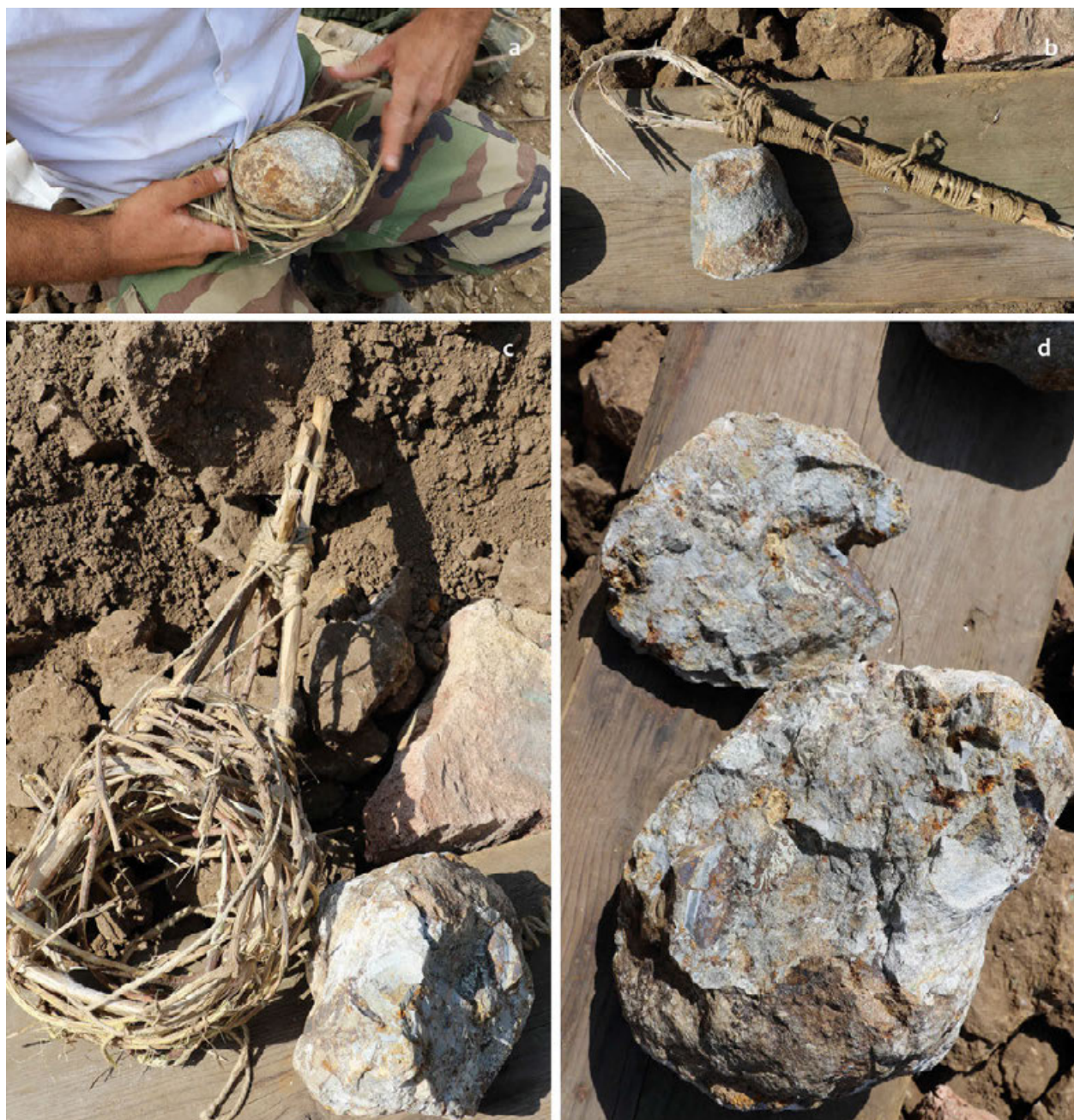
Fig. 11. Table represents damage that occurred on the working faces on the hammerstones and their reparation

Сл. 11. Оштећења на бајтовима и њихова репарација