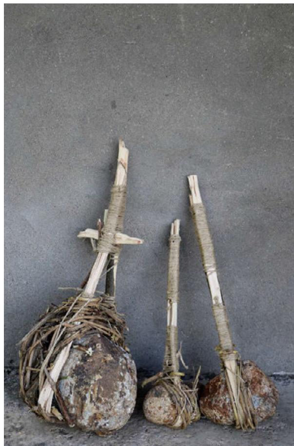
Fig. 6. Reconstruction of the hafted hammerstone and the massive pendulum-type hammerstone

Сл. 6. Реконструкција бајова са држаљом и масивној баји – тешка клајно