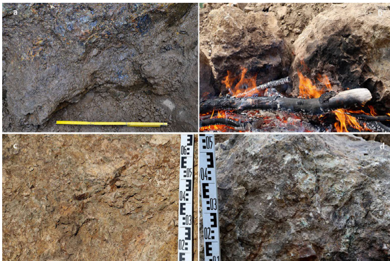
Fig. 12. a) Burn traces on the surface of the wall in Shaft 6 at Prljuša; b) soot formed on the wall of the stone block during its heating at the beginning of the experiment; c) traces of punching/crushing on the surface of the wall in Object 1; d) traces of punching/crushing on the stone block surface documented during the experiment

Сл. 12. а) шрапови горења на зидовима сџене у Окну б на Прљуши; б) тареж која је формирана на зиду сџене током њеној загревања на почетку експеримента; в) шрапови ударања на површини зида из Објекта 1; д) шрапови ударања на површини сџене документовани током експеримента