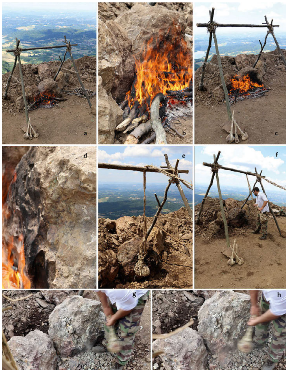
Fig. 8. a–c) Fire-setting and rock heating; d) cracks in the rock produced by high temperature; e, f) use of pendulum-type hammerstone; g, h) use of hafted hammerstones

Сл. 8. а–с) њаљење вајре и загревање сџене; д) њукојшине у сџени њроизведене високом штемјерајуром; е, ф) ујојџреба масивној бајша – џијша клајино; г, х) ујојџреба бајшова са држаљом