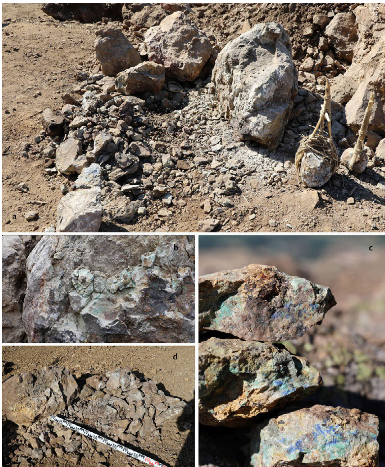
Fig. 9. a) The amount of crushed rock after 1 hour of work and the combined use of a pendulum – type hammerstone and a hafted hammerstone; b, c) the remains of malachite and azurite mineralisation inside the rock; d) the second crushed stone block

Сл. 9. a) количина разбијене ситене након сат времена рада и комбиноване употребе бајна – типског клайно и бајнова са држаљом; b, c) остаци минерализације малахијна и азуријна унутар ситене; d) разбијени други блок ситене