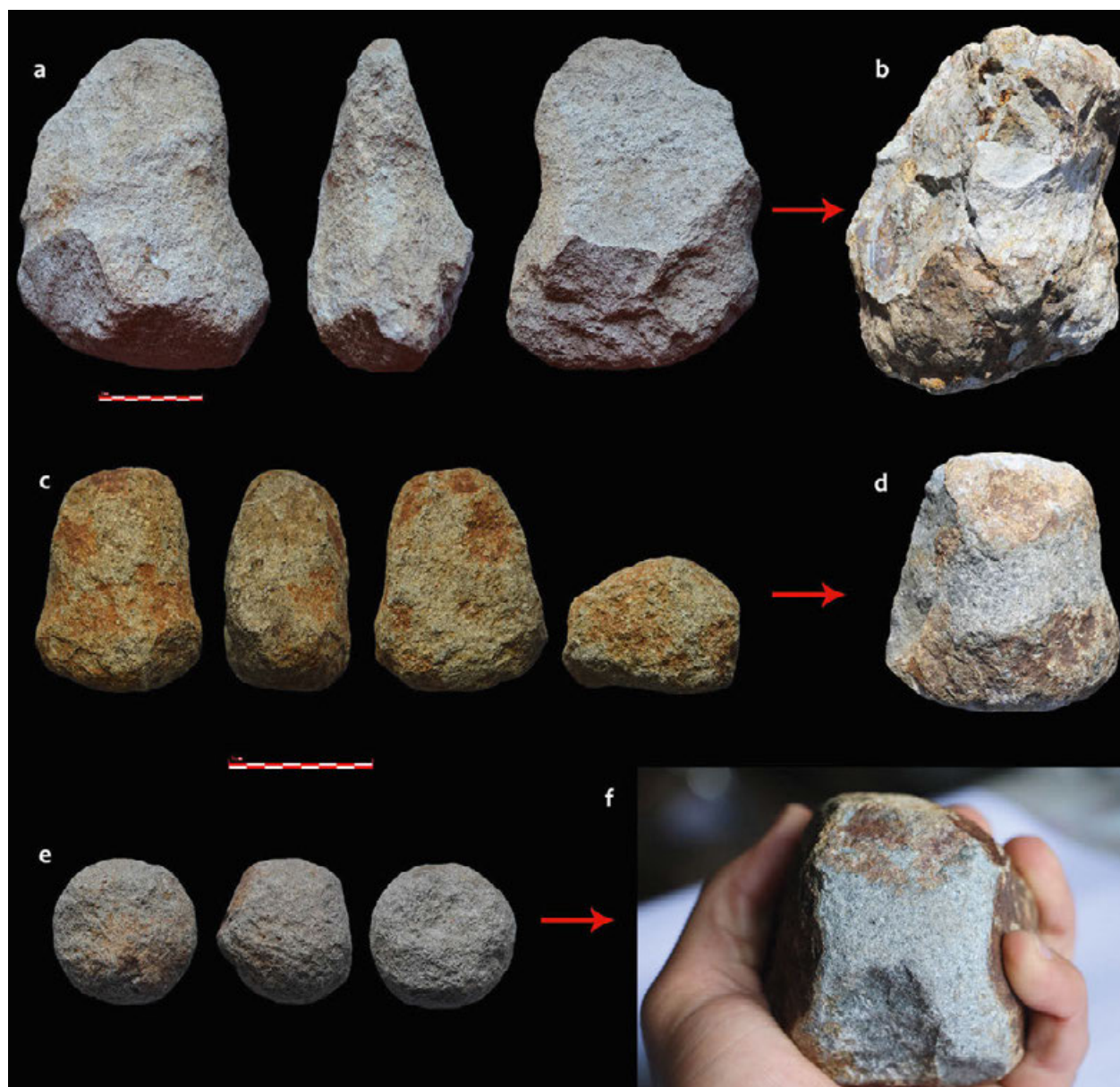
Fig. 14. A comparison of: a, c, e) original artefacts from Prljuša–Mali Šturac (C165/2015, C48/2015, C91/2015); b, d, f) experimentally made artefacts

Сл. 14. Упоредни приказ: а, с, е) оригинални артефакти са локалитета Прљуша–Мали Штурец (Ц165/2015, Ц48/2015, Ц91/2015); б, д, ф) експериментално израђени артефакти