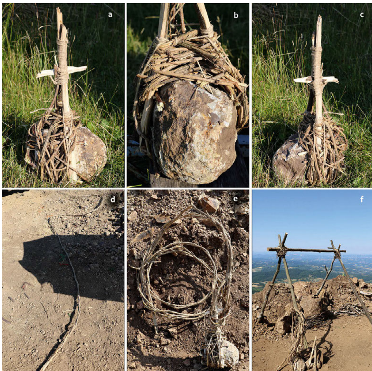
Fig. 7. Reconstruction of the massive pendulum-type hammerstone, rope and the construction from which it was suspended

Сл. 7. Реконструкција масивној баџи – шијау клијно, ужеја и конструкције о коју је окачен