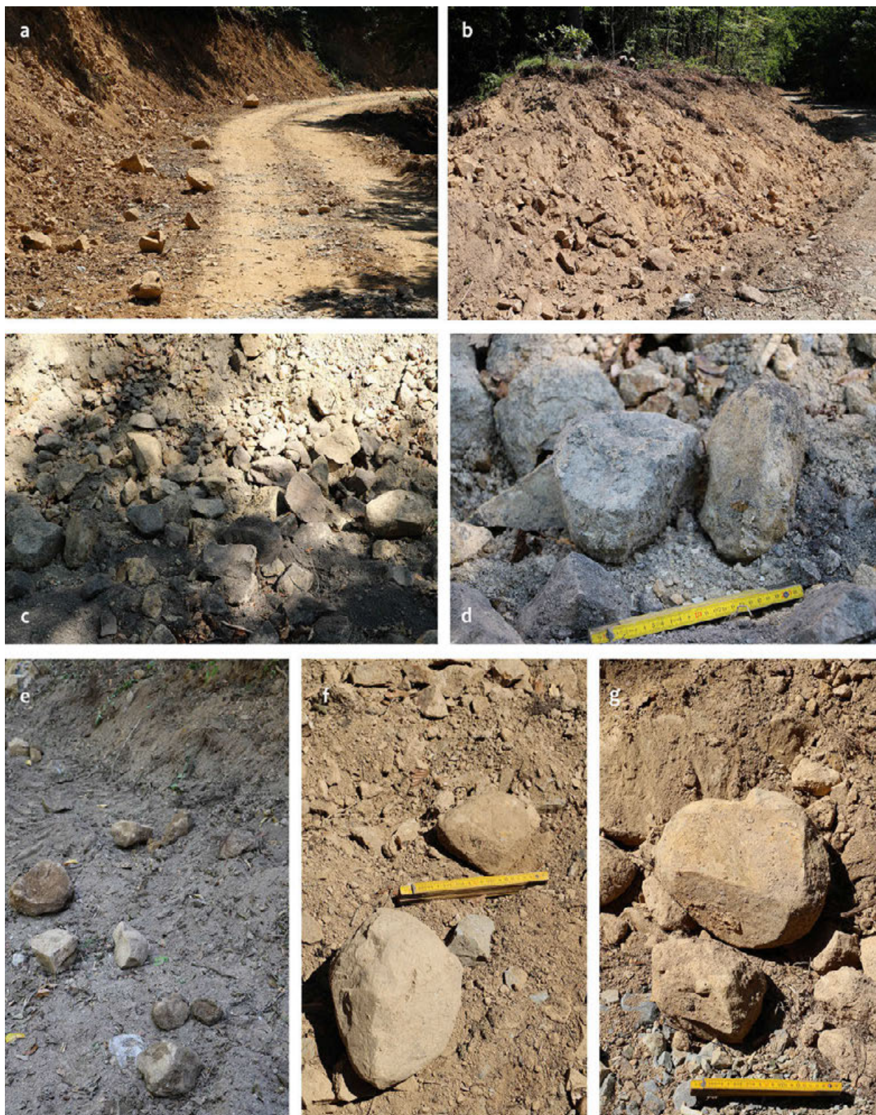
Fig. 10. Egg-shaped stones fallen from the bank on the side of the road which leads to the mountain top