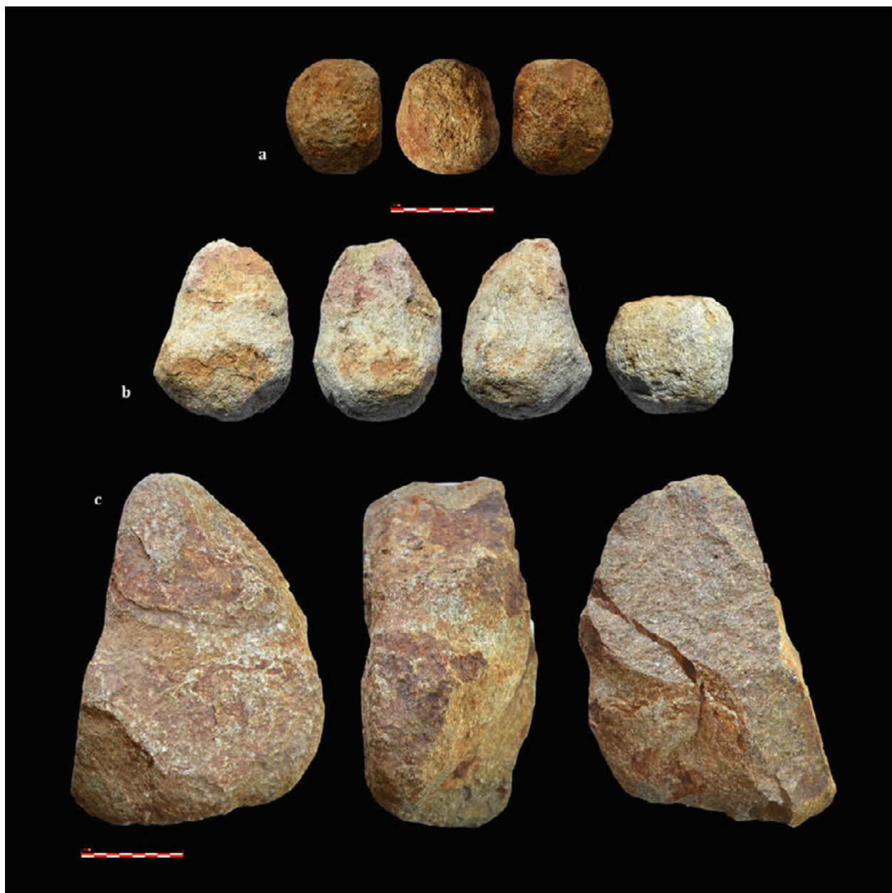
Fig. 2. Examples of three main types of hammerstones from Prljuša: a) hand-held hammerstone (C 7/2015); b) hafted hammerstone (C181/2015); c) pendulum-type hammerstone (C49/2014)

Сл. 2. Примери три основна типа рударских бајтова са Прљуше: а) ручни бајт/ударач (Ц 7/2015); б) бајт који се пријаја за држаљу (Ц181/2015); в) масивни бајт клајно (Ц49/2014)