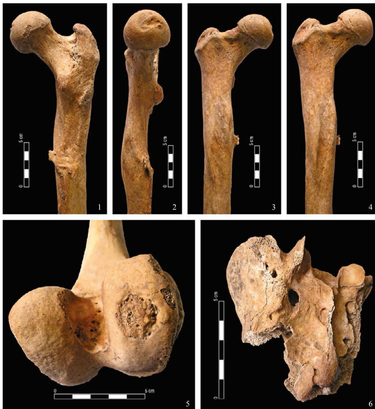
Plate I – 1–4) healed fracture of the right femur and myositis ossificans traumatica on the posterior side of the body; 5) osteochondritis dissecans on the medial condyle of the left femur; 6) dislocation of one of the segments on the posterior part of the sacrum

Табла I – 1–4) срасиџао њрелом на десном фемуру и myositis ossificans traumatica на њосџериорној сџрани њела фемура; 5) osteochondritis dissecans на медијалном кондилу левој фемура; 6) дислокација једној сејмениџа на њосџериорној сџрани сакрума