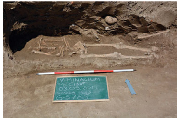
Fig. 1. Viminacium, site of Pećine, Grave 5785

Сл. 1. Виминацијум, локалитет Пећине, гроб 5785