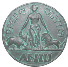
ARCHAEOLOGICAL PARK VIMINACIUM