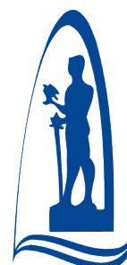
TOURIST ORGANISATION OF BELGRADE