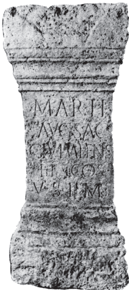
Fig. 1. Ara, Mars, Sremska Mitrovica

f(iciarius) co(n)s(ularis)/ v(otum) s(olvit) l(ibens) m(erito).