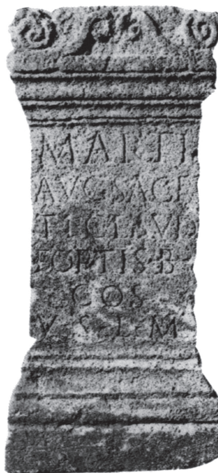
Fig. 2. Ara, Mars, Sremska Mitrovica