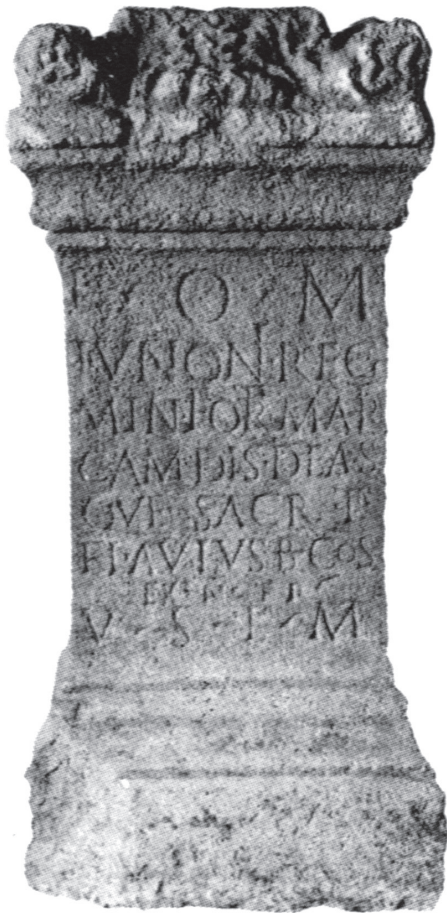
Fig. 3. Ara, Jupiter, Juno, Minerva, Fortuna, Mars and diis deabusque, Sremska Mitrovica

Jupiter – Juno – Minerva – Fortuna - gods and goddesses - Mars