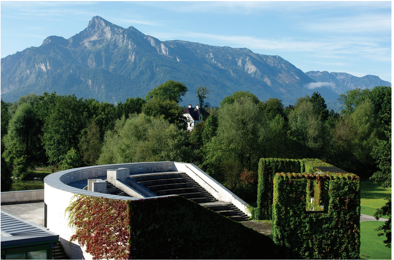
View from the Faculty of Natural Sciences to the Untersberg Massif in the southwest