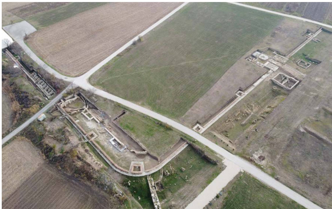
Fig. 1 North-western part of the military camp, shot from the drone

the communication that stretched from the street, i.e. the gate, to the west – the city. Parts of the western and northern rampart were also discovered, as well as the north-western corner tower and lateral towers on the ramparts. Aside from the channel within the gates, several more drainage channels were researched, through which the waste waters from the fort went to the ditch. On the basis of the stratigraphy, manner of building and numerous archaeological findings, two basic phases of the construction of the fortress were established – an older one, dated to the last decades of the 1st century, and a more recent one, dated to the 2 nd century.