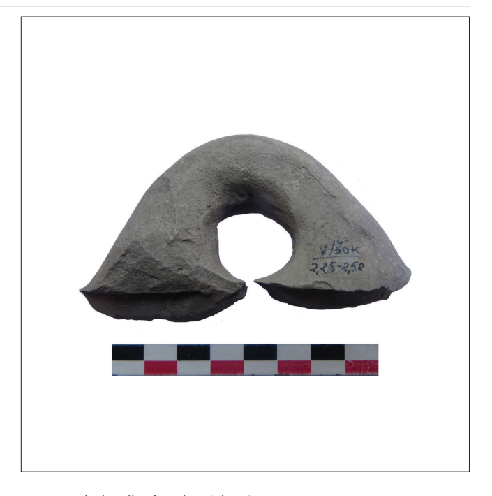
FIGURE 1. The handle of a peka, Vinkovci.

On the site of Vinkovci-Šokadija<sup>18</sup> a handle from a peka was discovered, placed aside on the recipient (Pl. 2: 1; Fig. 1). It was made of grey clay with a small number of inclusions and dated to the 1st century. A similar handle and a fragment of the recipient were found on the site of Kuzmin (Bregovi-Atovac) in Srijem during research on a settlement dated to the 1st century BC.<sup>19</sup>