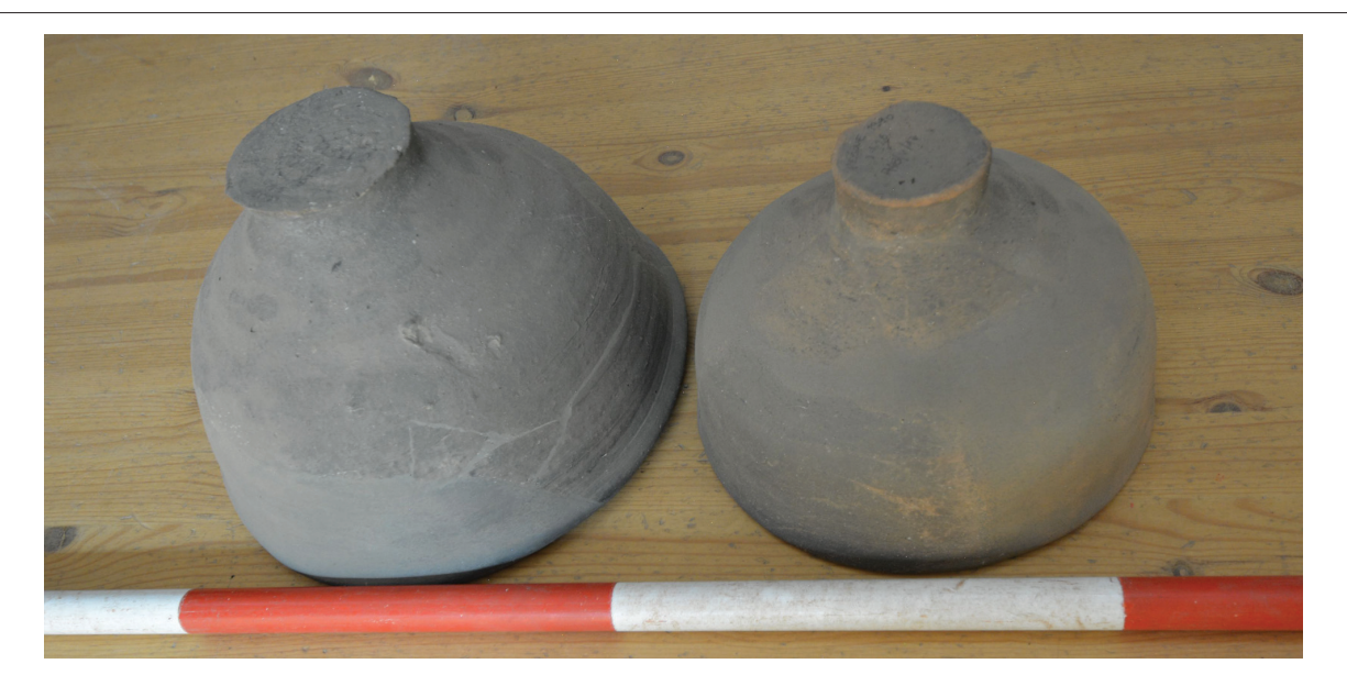
FIGURE 3. Deep lids, Viminacium.

dure is followed in modern ovens, too, and was also confirmed in the replica of a beehive oven in Andautonia Archaeological Park in 2004. The Apicius cookbook describes the way patina is prepared: embers are placed around the dish itself and atop the lid. This method of cooking is similar to the preparation of dishes under the sač and suitable for application on an open hearth. The lids that complement this type of plate have a ring-shaped or curved rim which could hold the embers in place. The statistical predominance of the plates on the vast majority of sites shows that they were multi-functional and practical, so they could be used both for serving food and for its consumption. It seldom happens that the ancient sources and ethnology describe a certain procedure in almost identical ways. The procedure of using the ceramic peka , or a vessel for baking on an open hearth, has remained the same from prehistory until today.