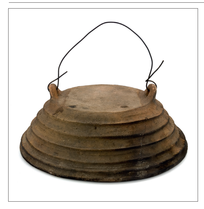
FIGURE 4. A reconstruction of a peka, island of Iž (The Ethnographic Museum, Zagreb).