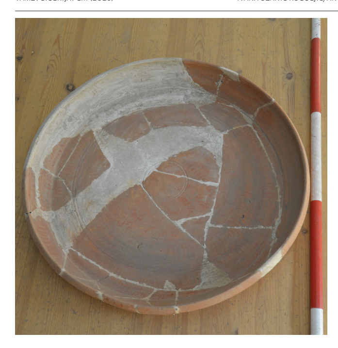
FIGURE 2. A specimen of a large Pompeiian plate, Viminacium.

during the baking process. Naturally, we should bear in mind the kind of thermal shock these lids endured and the fact that they could not remain unimpaired for a long time. In all likelihood, after a certain period of usage, they cracked or broke due to the sudden temperature changes, and had to be discarded.