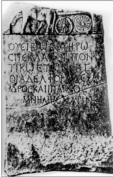
Fig. 3 Tombstone of the speculator Vibius Severus from Tomis, AE 1960, 348 (Mrav 2011: fig. 14)