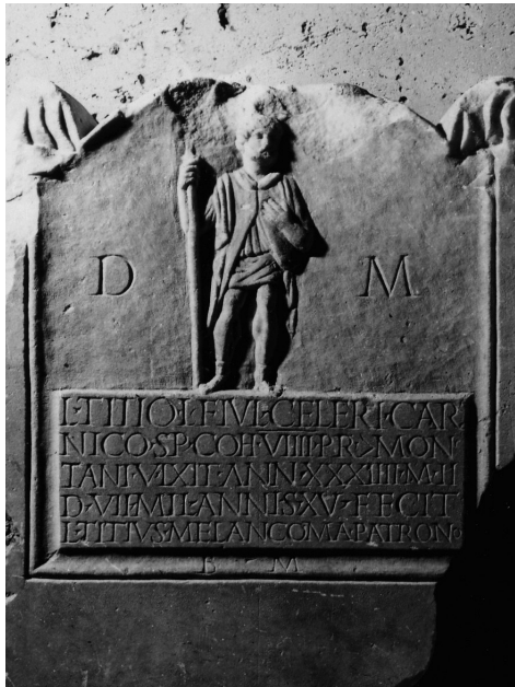
Fig. 10 Tombstone of the speculator L. Titio L., AE 1931, 91 (Crimi 2012: fig. 1)