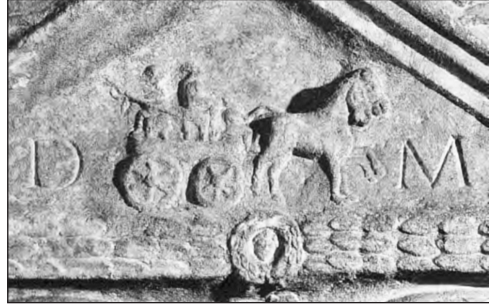
Fig. 4a Detail of fig. 4