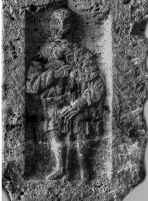
Fig. 9 Detail of the sarcophagus of the immunitas caeriensis legionis P. Aelius Mercator from Brigetio, RIU 2, 506 (Pochmarski 2001: fig. 5)