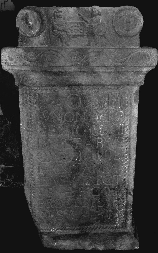
Fig 8 Votive monument of a beneficiarius consularis from Osterburken, AE 1985, 688