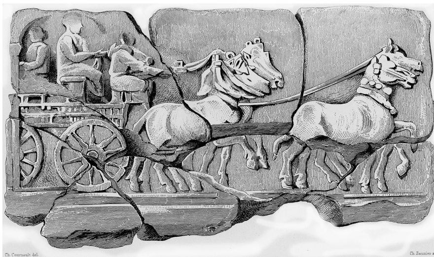
Fig. 7 Tombstone from Langres (Letronne 1854)