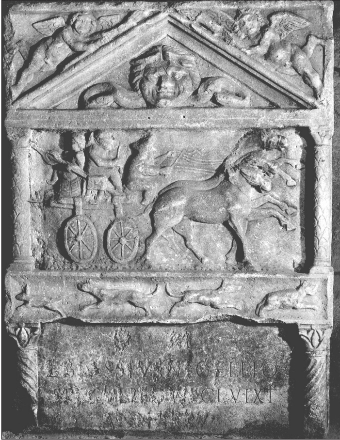
Fig. 1 Tombstone of the speculator L. Blassius Nigellio from Viminacium, IMS II, 106 (National Museum, Belgrade)