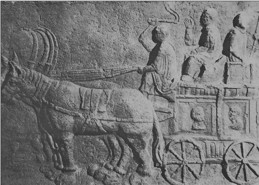
Fig. 5 Tombstone from Vaison (Mrav 2011: fig. 15)