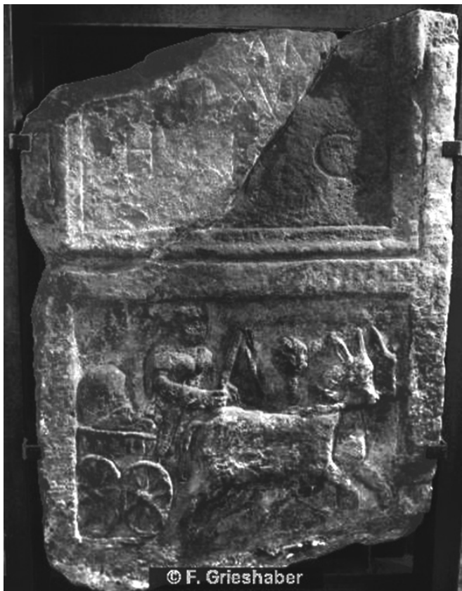
Fig. 6 Tombstone from Strasbourg, CIL XIII 11630