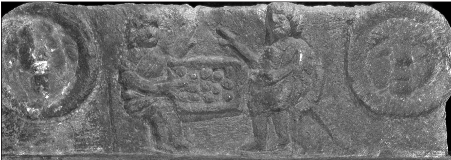
Fig 8a Detail of fig. 8