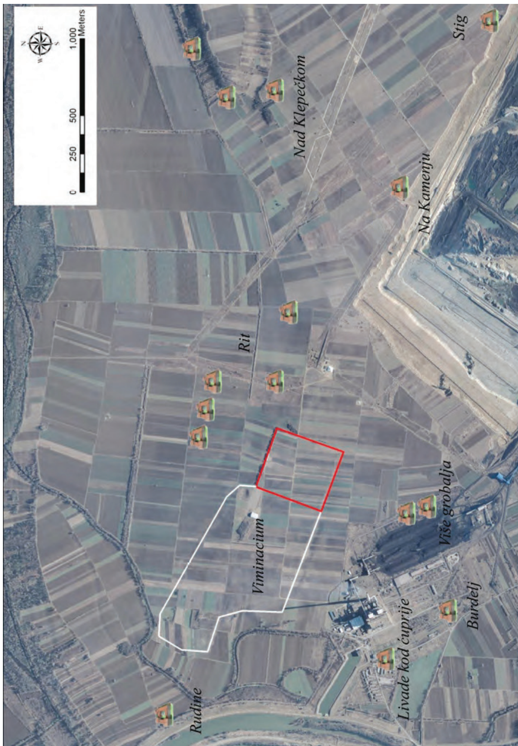
Fig. 1 – Villae rusticae at Viminacium and its surroundings.