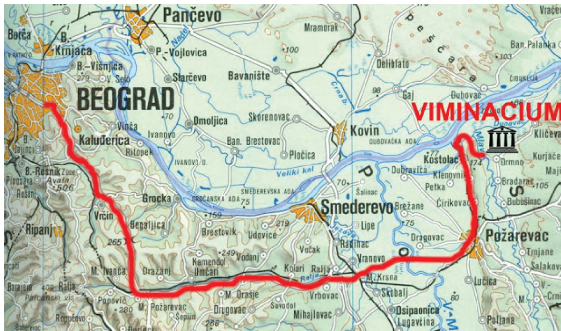
Map 2 – Roman road Singidunum-Viminacium.

enabled the continuous transit of merchandise and safe markets (Map 2).