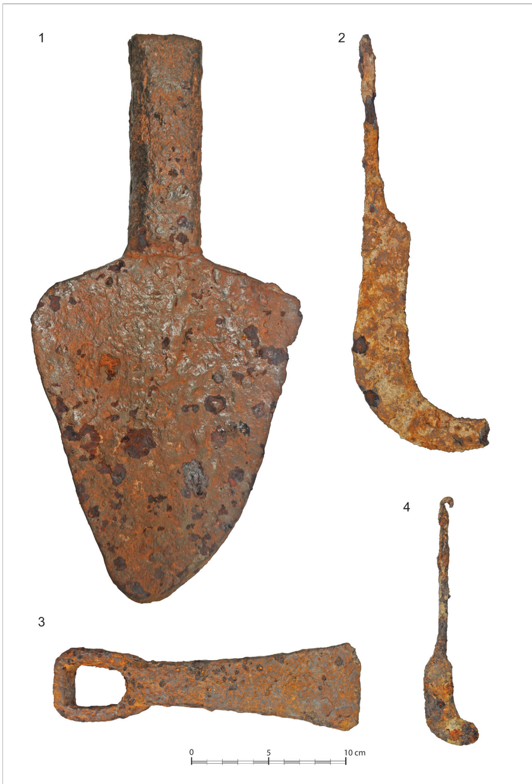
Fig. 3 – Agricultural tools from the sites: 1 – Burdelj; 2 – Rit; 3, 4. – Nad Klepečkom.