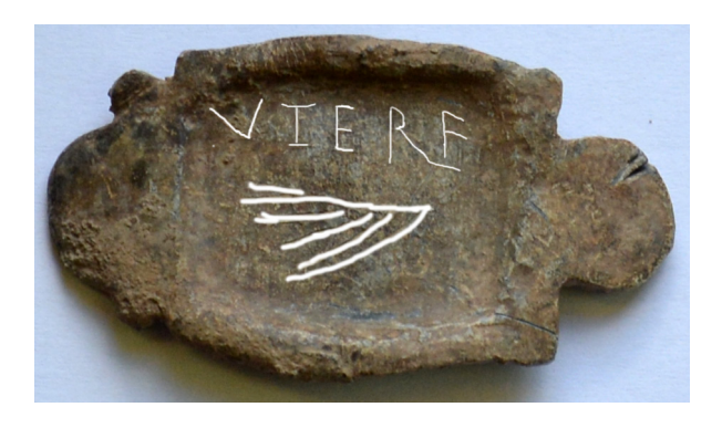
Figures 1a-b, 2, Lead plate (Rit)