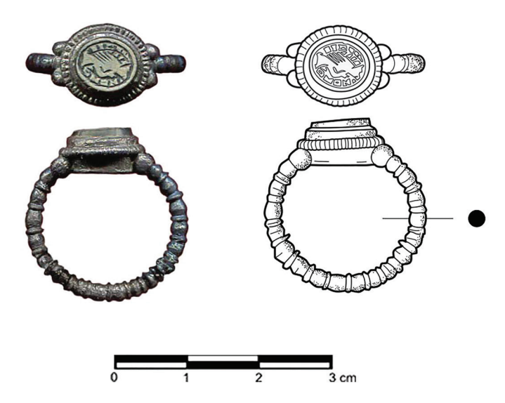
Fig. 2. Engagement ring from Viminacium (photo and drawing by A. Subotić, Documentation center Viminacium). / Inelul de logodnă de la Viminacium (foto și desen de A. Subotić, Centrul documentar Viminacium).