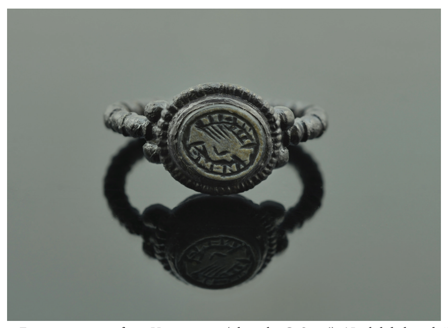
Fig. 3. Engagement ring from Viminacium. / Inelul de logodnă de la Viminacium.