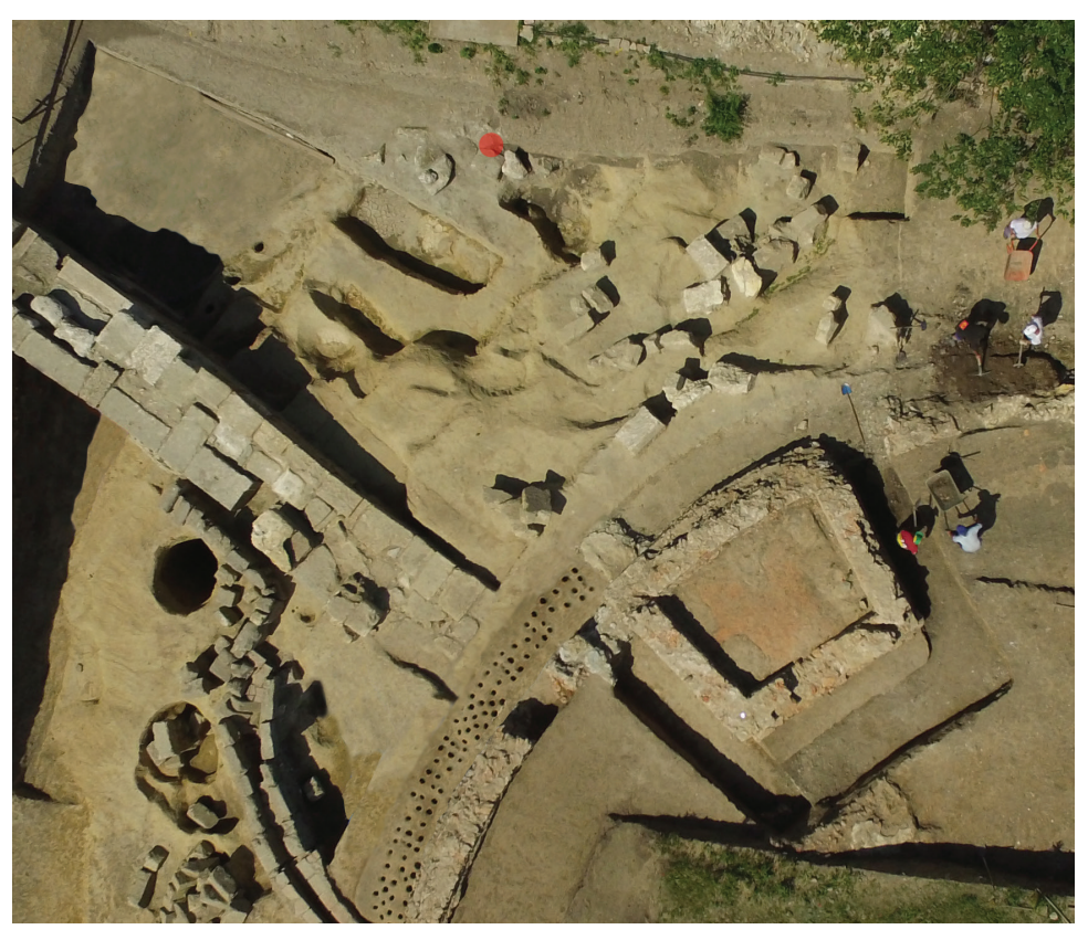
Fig. 1. Northwestern corner of the fort with the findspot of the ring. / Colțul nord-vestic al fortului, cu locul unde a fost descoperit inelul.